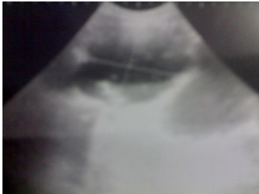
figure3: Plain abdominal radiograph