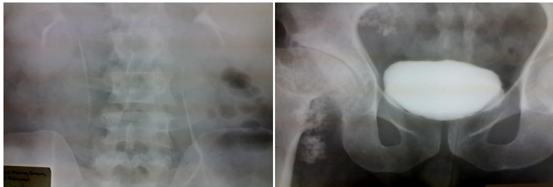
Figure 3: intravenous urogram