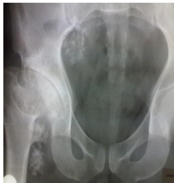
figure2: Plain abdominal radiograph