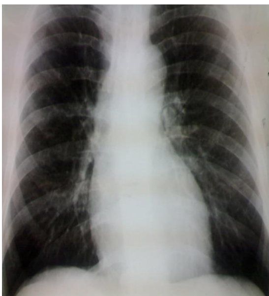
figure1 : Chest x-ray

Intraoperative, after preparing the patient and under general anesthesia a lower midline incision was done. The findings were retroperitoneal mass (cyst) about (9x9cm) in size adherent with the surrounding tissue. When the cyst had been opened, serous fluid and mucus gelatinous material with debris and 2 stag horn stones (3x3cm) each containing inside it were identified. The mass extended downward through the right femoral canal to the thigh and an incision below the right inguinal ligament was done. The skin was opened in layers, the size of this part is about (4x4x6 cm) and another stag horn of (3x3cm) size was found inside it. Total excision of the whole cyst was done. Fluid was sent for cytopathology for microscopic examination and the result was Negative for malignancy; benign mesothelial cells. Regarding the cyst and Inguinal lymph node samples that were sent for histopathology; mesothelium lined peritoneal cyst containing 3 nodular white calcified bony masses {3x3cm} inside it and was Negative for malignancy. Inguinal lymph node histopathology showed reactive lymphoid hyperplasia